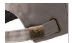
Size adjustable with a brass clip