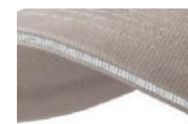
Sewn-in stripe in contrast colour